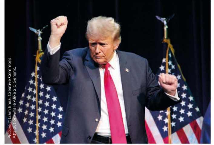
Donald Trump, President.

On November 5th 2024 The United States of America had their presidential elections. The media and American polls were forecasting a close result. The candidates needed 270 seats to win the election.