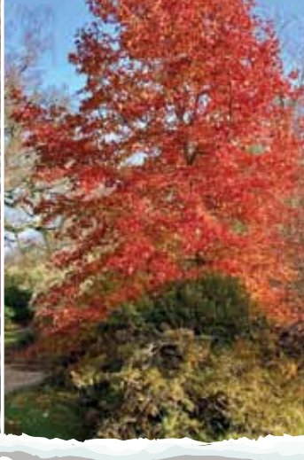
Zelkova serrata Japanese zelkova